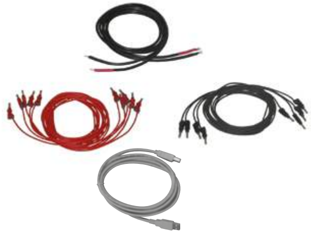
TD 1000 PLUS - Standard cable kit

The kit includes cables for any kind of connection.