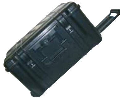
Heavy duty transport case

Heavy duty transport case in black plastics, with wheels, cover and handle.