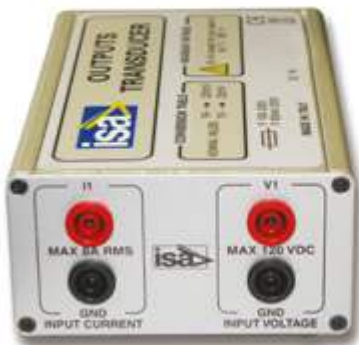
Output transducer module

The items can be ordered separately: the Output transducer alone, or also one cable or both.